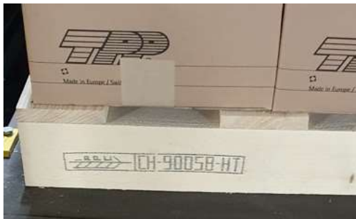
Stamp on TPP pallets